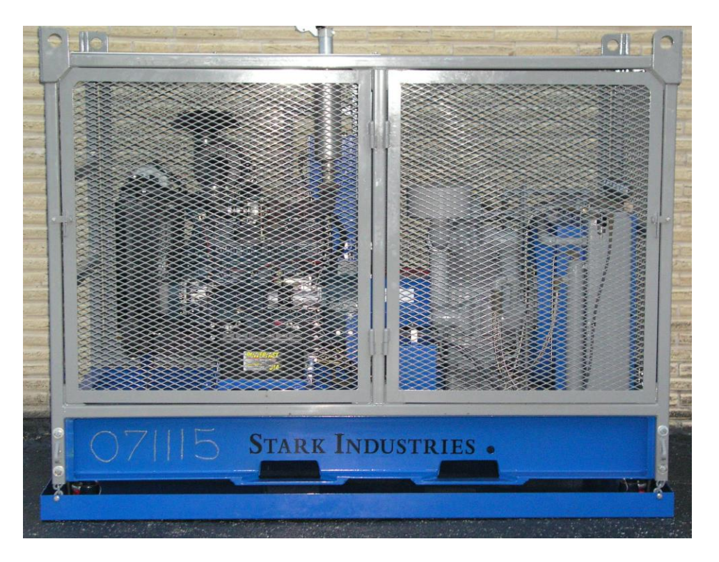
This is an extremely heavy duty package Very smooth running compressor